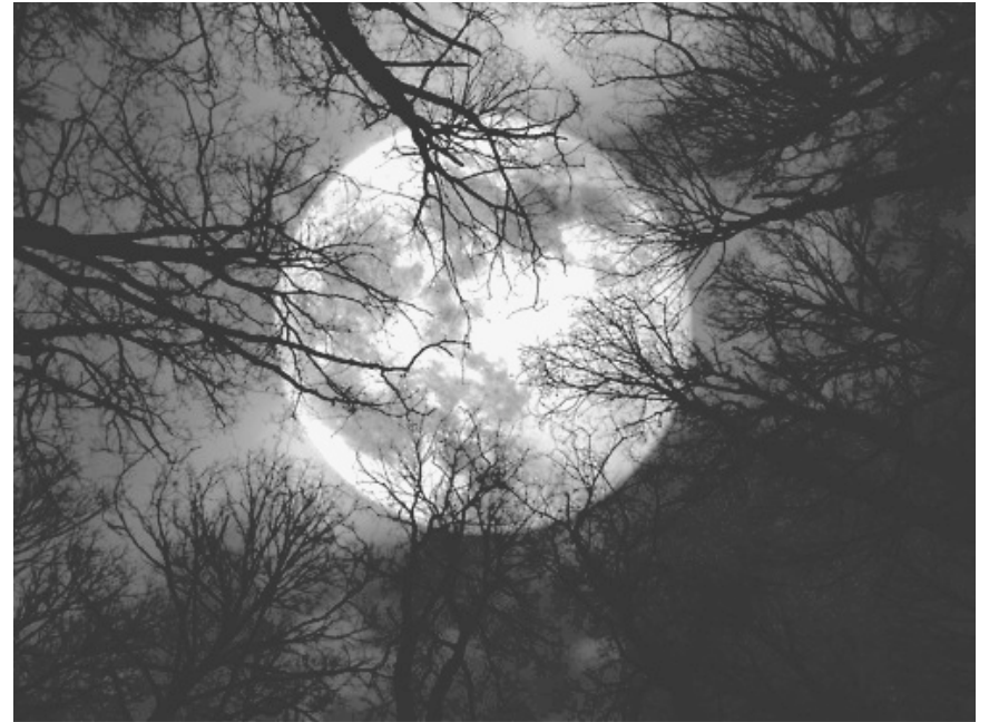
Mask of the Red Death